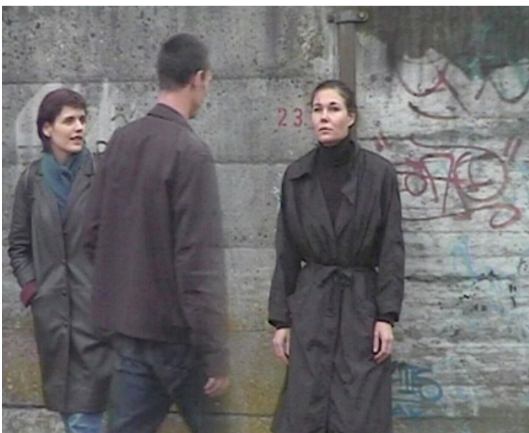
Mathilde ter Heijne , , stills from Suicide Bomb , 2000, single-channel DVD, 5 minutes