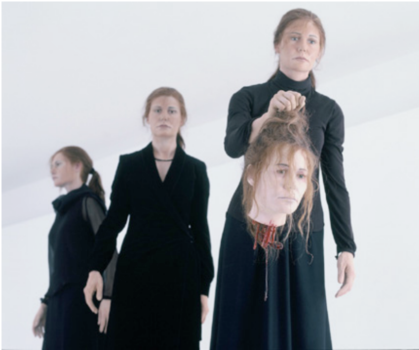
Mathilde ter Heijne , Menschen Opfern [Human Sacrifices] , 2002, sound installation with dummies

The production of dummies modeled on her own appearance has become a central component of ter Heijne's practice. On some occasions, the dummies show up in video installations where, featured in the video as well as in the exhibition space, they provide an environmental link between the projected footage and the space we occupy as viewers. Sometimes, the dummies sit inconspicuously in the corner of a gallery. Thanks to hidden built-in speakers, one babbles like a madwoman, another sings along to a love song on a transistor radio, and still another hurls the sorts of insults and repressed thoughts that the artist herself would not dare, or care, to speak. It is as if those mute shop-window mannequins, so admired by the Surrealists, had begun to talk back. The Surrealist Hans Bellmer once projected his sadistic fantasies onto the dolls that he created and photographed his poupées . As Hal Foster has argued, Bellmer even wanted to become his dolls in a masochistic way, as a challenge to Nazi authority, and to genital authority more universally. 3 Ter Heijne has acknowledged that her use of dummies to stage her own death satisfied her desire to blow up the artistic ego. Yet, blowing up the artistic ego has never been much of a problem for women artists. Bellmer's wife, Unica Zrn, wrote a devastating account of an adolescent girl's journey toward suicide in Dark Spring . Shortly after the novel was published, Zrn herself jumped from her apartment window.