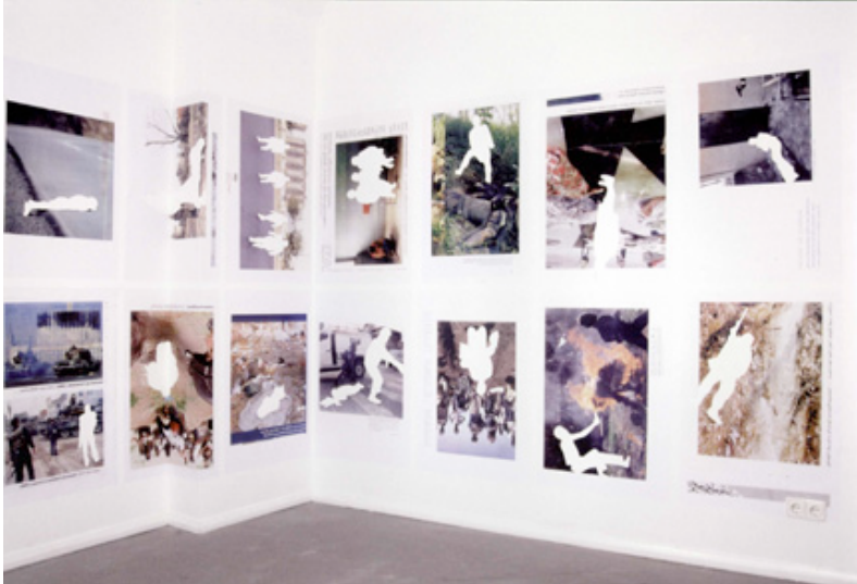
Mathilde ter Heijne , , stills from Suicide Bomb , 2000, single-channel DVD, 5 minutes